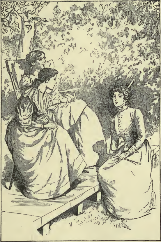
POLLY TELLS THE NEWS